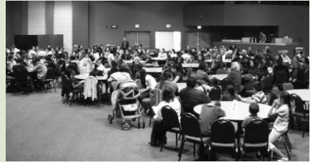
Another great moment: Lao, Chinese and Vietnamese congregations share a meal