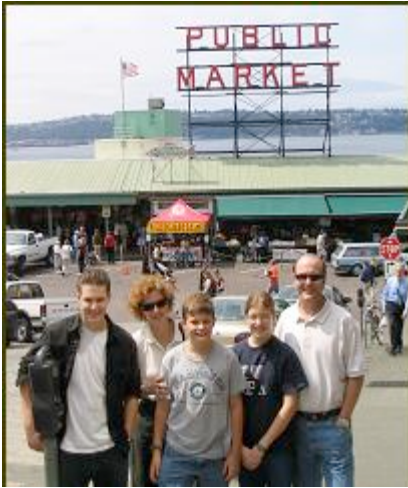
At Seattle's Pike Market